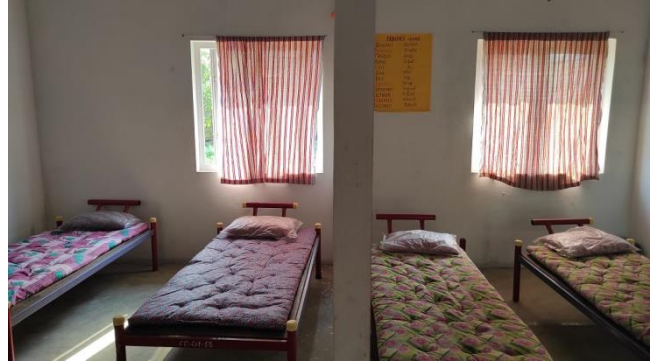
Isolation center with 20 beds capacity