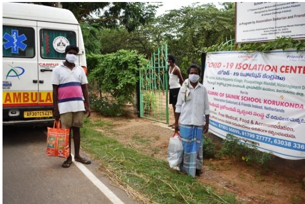
Positive patients admitted in to Isolation center