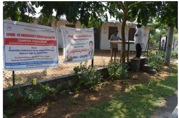
Food and Medicines supply to COVID victims

The district administration requested all the nodal NGO's to help to control spread of COVID in their respective mandals. They instructed to convert Government schools and office buildings as COVID -19 isolation centers. It will help the spread of COVID to their family members by isolating them in the isolation centers in their villages. The AS management come forward to convert our special school, next to our Campus main gate converting as isolation center with 20 beds, food, Oxygen and all medical emergency facilities for 374 villages.