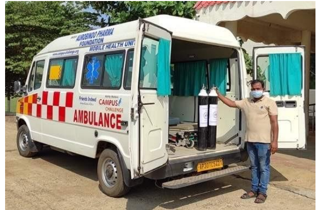
7th May 2021, Ambulance equipped with Oxygen facility to give emergency medical assistance to COVID-19 victims