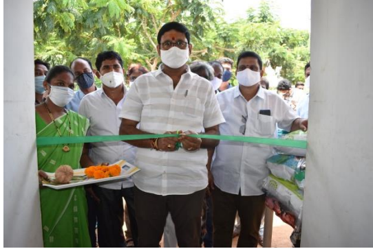
Road school as Isolation center